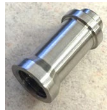
Removable Ultrasonic Thickness/Mass Loss Coupon