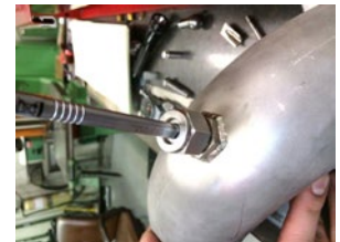
UT probe inserted into a coupon installed in the extrados of a 3 inch, schedule 40, 90 degree stainless elbow