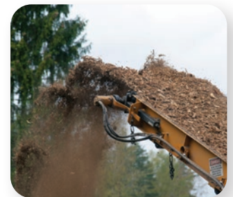
Below: Woodchip Production