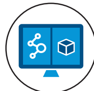
materials design & processing