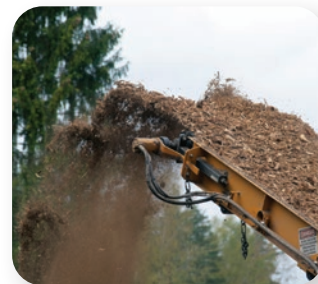
Below: Woodchip Production